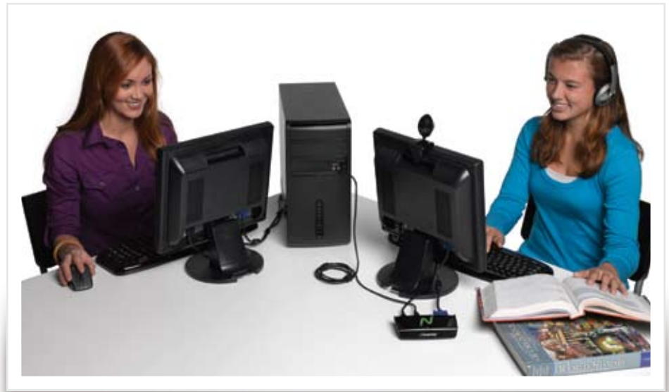
The U170 is ideal for classrooms, public access, small business, digital signage, and home use.

Desktop virtualization does not have to be complex. Or expensive. Unlike other desktop virtualization solutions, NComputing does not need expensive and complicated servers and infrastructure. In fact, vSpace was designed to efficiently share the normally wasted CPU cycles in standard low-cost PCs. In an NComputing solution, vSpace creates multiple virtual workspaces in one physical computer, and then the additional users connect their monitors, keyboards, and mice, through a simple access device. With the U170, connecting the access device to the shared computer couldn't be easier: just snap them together with the included USB cable.